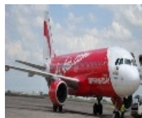
Clark :: Part 1